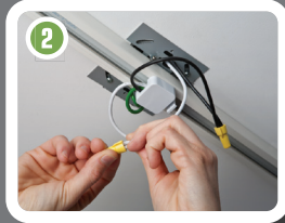
2 Connect track to mounting plate and wire.