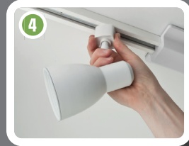
4 Simply twist heads onto track.