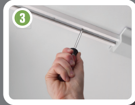
3 Attach track to ceiling.