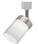
LTHCYLD (qty 3) - adjustable track heads (included)